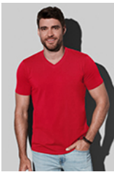
ST9610 Clive V-neck